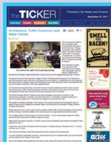
The Ticker Daily Email & Website